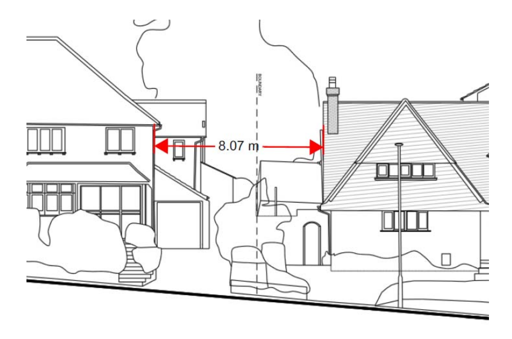
Existing separation distance between windows of 16 and 18 Smitham Downs Road