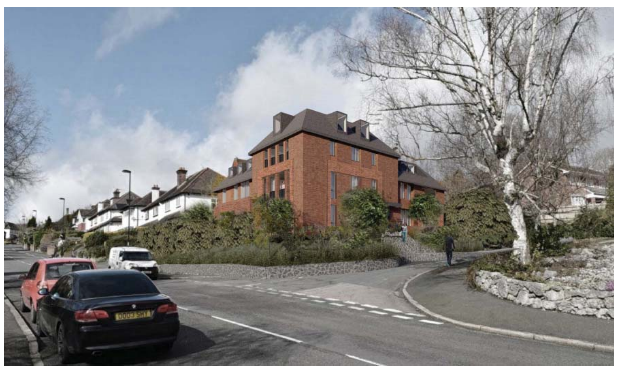
Proposed CGI (previous)

4.2 When originally presented to Planning Committee on 15<sup>th</sup> July, the proposed scheme was a building in red stock brick with dark grey roof tiles: