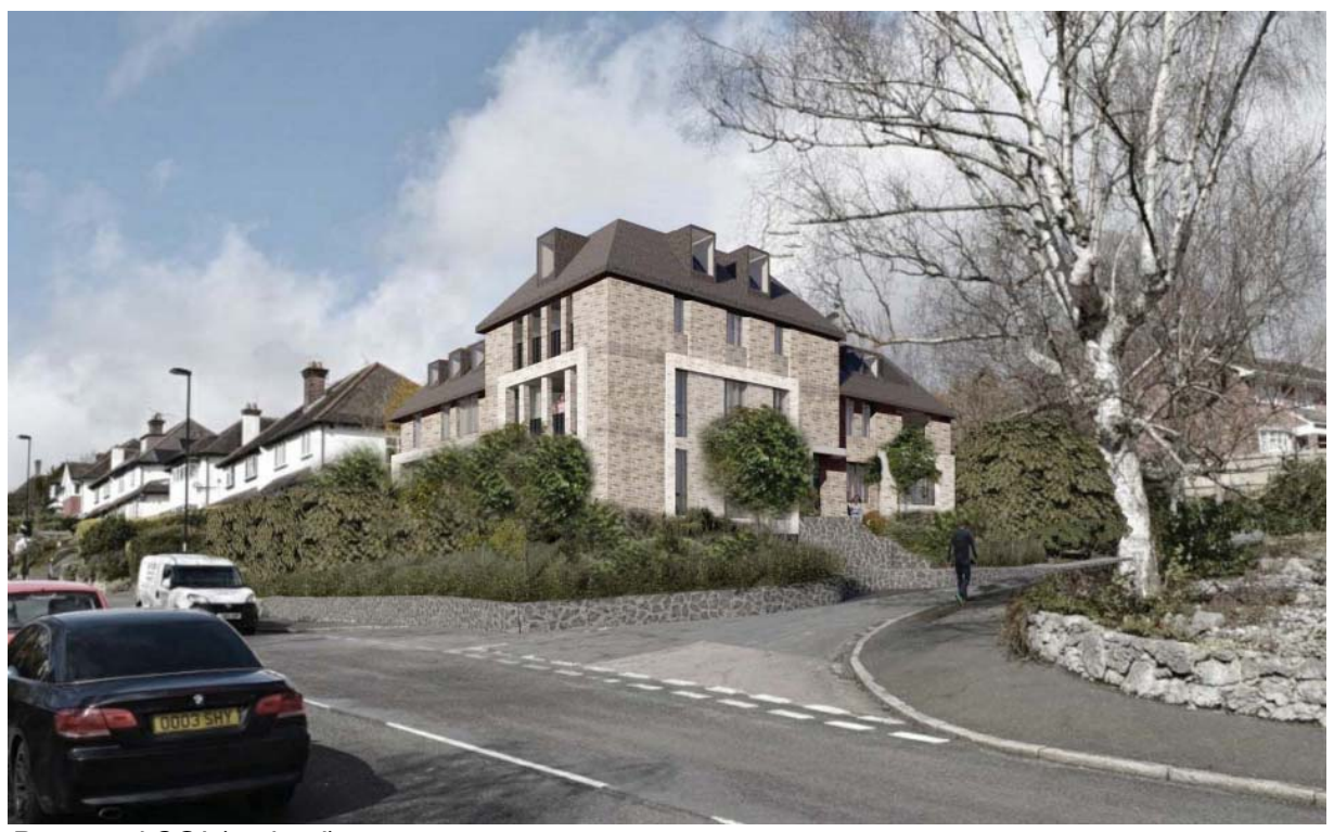
Proposed CGI (revised)

4.3 Members raised concerns about the appropriateness of the bricks in the context of the area which predominantly comprises buildings in white render. The bricks have now been revised to be yellow/buff bricks with dark grey roof tiles: