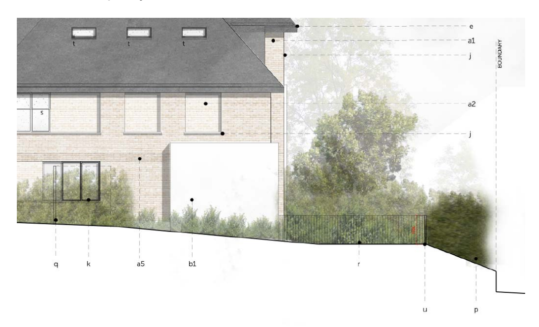
Proposed section of west elevation